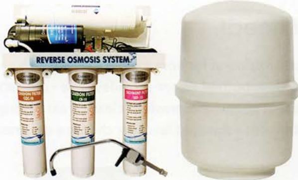
475 Pro Series With Booster Pump